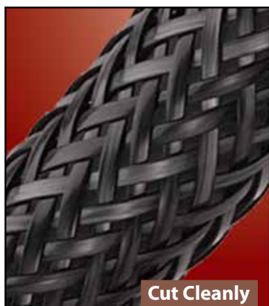
Cut Cleanly Hot Knife