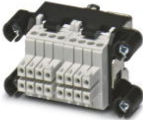
Contact insert set for sleeve side, sleeve frame with PE, 4 fixing screws, 8-pos. contact inserts preassembled, 6 coding profiles

Please be informed that the data shown in this PDF Document is generated from our Online Catalog. Please find the complete data in the user's documentation. Our General Terms of Use for Downloads are valid ( http://phoenixcontact.com/download )